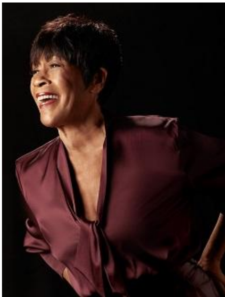
Bettye LaVette (Featured Artist '21) Blues Hall of Famer/6X Grammy Nominee

Sanctuary's inclusive vision has garnered a community of active and loyal readers who regularly send us inspirational stories, comments, and detailed feedback about our features and articles. This consistent and welcomed engagement with our audience makes Sanctuary a special place where readers feel they intimately belong.