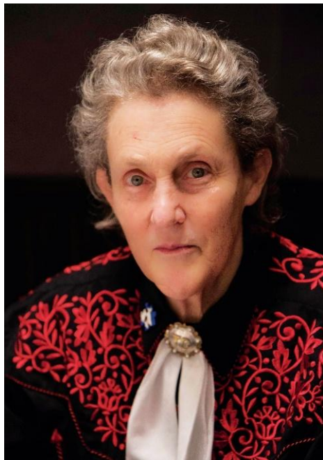
Temple Grandin, Ph.D. (2018 Featured Interview)