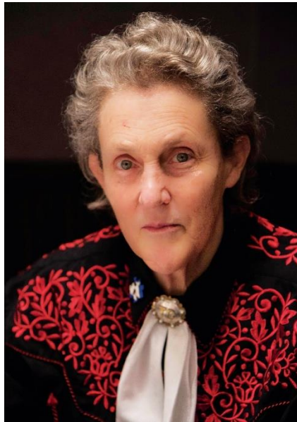
Temple Grandin, Ph.D. (2018 Featured Interview)