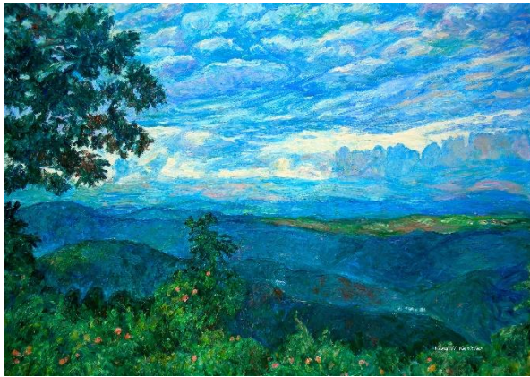
© Kendall Kessler (2016 Featured Artist)

Average unique visitors per year: > 78,000