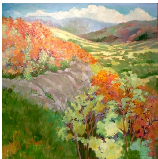
© Lynne Friedman (2016 Featured Artist)

Our free, monthly e-newsletter announces current features, previews upcoming site content, and provides interactive, inspirational questions for subscribers. It is distributed to hundreds of loyal readers, including editors, publishers, PR firms, artists, authors, musicians, photographers, entrepreneurs and non-profit leaders from 17 countries and 29 states in the U.S.