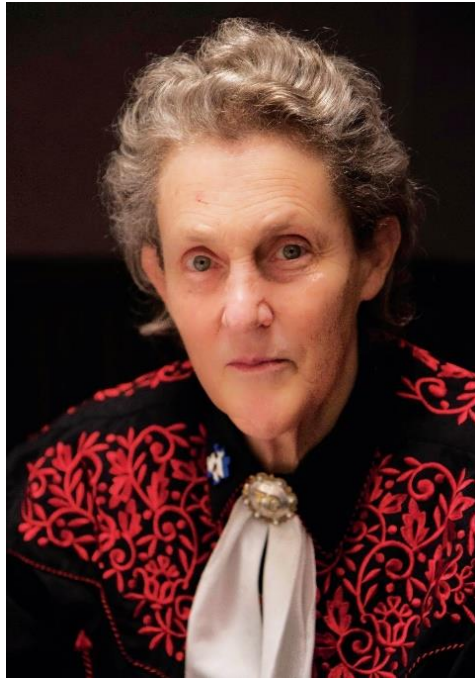
Temple Grandin, Ph.D. (2018 Featured Interview)

“Awesome interview with Temple Grandin - an amazing woman!”