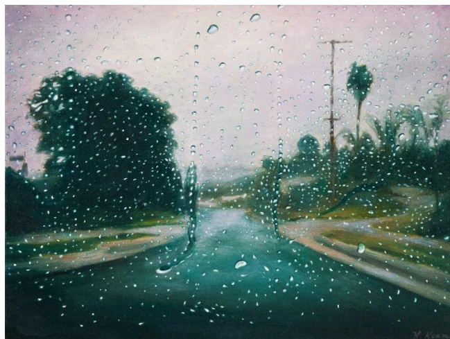
© Katherine Kean (2019 Featured Artist - Oil on Linen)

Our free, monthly e-newsletter announces current features, previews upcoming site content, and provides interactive, inspirational questions for subscribers. It is distributed to hundreds of loyal readers, including editors, publishers, PR firms, artists, authors, musicians, photographers, entrepreneurs and non-profit leaders from 20 countries and 34 states in the U.S.