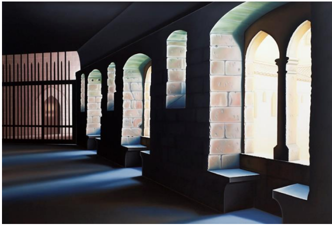
© Pennie Brantley (2020 Featured Artist - Oil on Canvas - 48X72)

Our free, monthly e-newsletter shares current features, upcoming content, giveaways, contests, and interactive prompts.