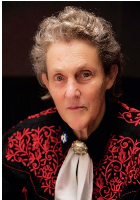
Temple Grandin, Ph.D. (2018 Featured Interview)