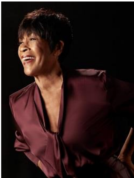
Bettye LaVette (Featured Artist '21) Blues Hall of Famer/6X Grammy Nominee

Sanctuary's inclusive vision has garnered a community of active and loyal readers who regularly send us inspirational stories, comments, photos and detailed feedback about our features and articles. This consistent and welcomed engagement with our audience makes Sanctuary a special place where readers feel they intimately belong.